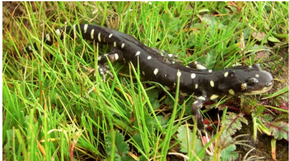
The endangered California tiger salamander is among the listed species included in the East Contra Costa County Habitat Conservation Plan.

an HCP is needed. FWS staff can also provide technical assistance to help design a project to avoid take. For example, the project could be designed with seasonal restrictions on construction to minimize disturbance to a species.